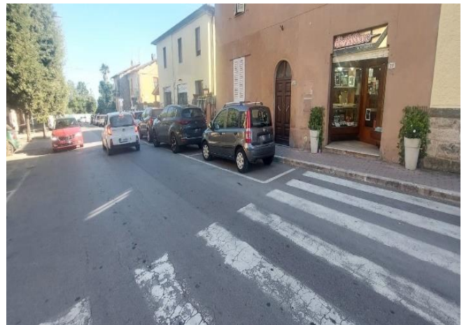
2 Public parking via XXIV Maggio