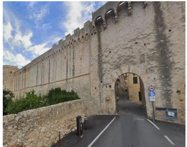
19 Via XX Settembre

Project carried out with the contribution of the