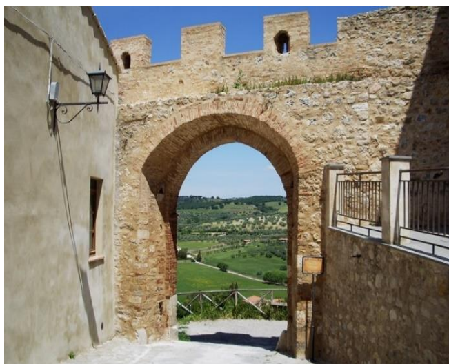
15 Porta San Martino