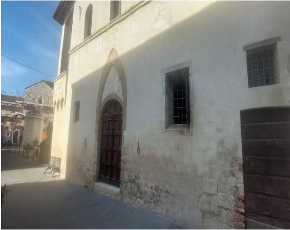
28 Palazzo dei Priori. Entrance portal with pointed arch