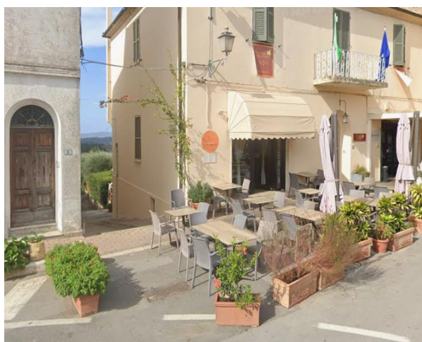
46 Outdoor veranda