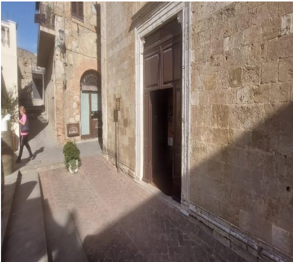
22 Ramp and entrance portal of the Church of San Giovanni Battista