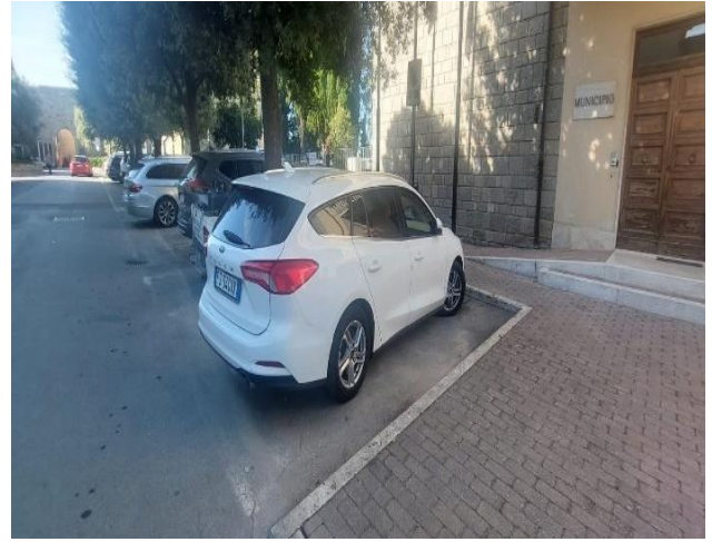
4 Public parking Via XXIV Maggio