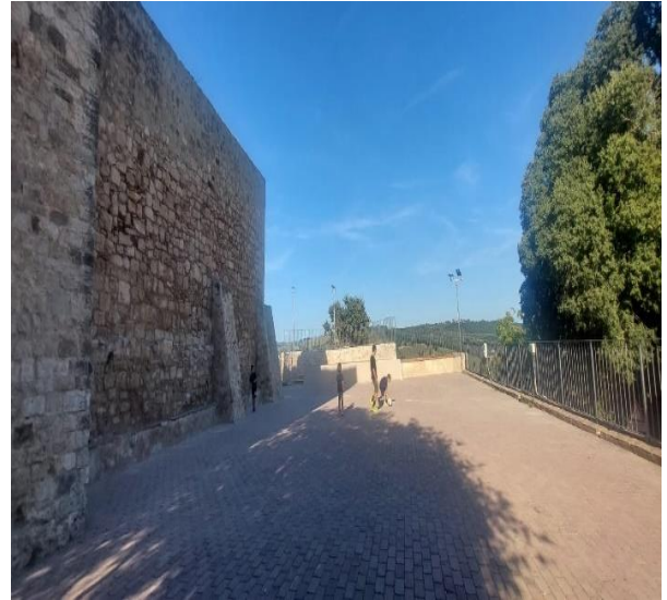
12 Castle wall circuit