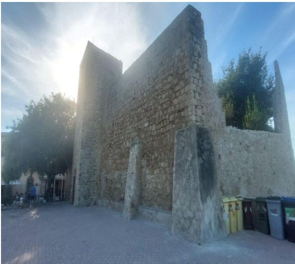
13 City walls