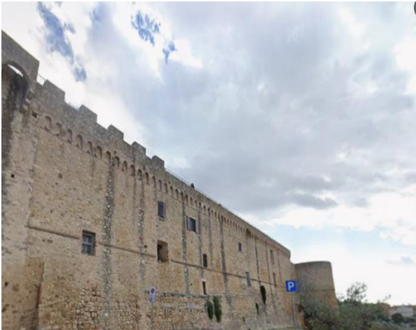
18 View of the city walls