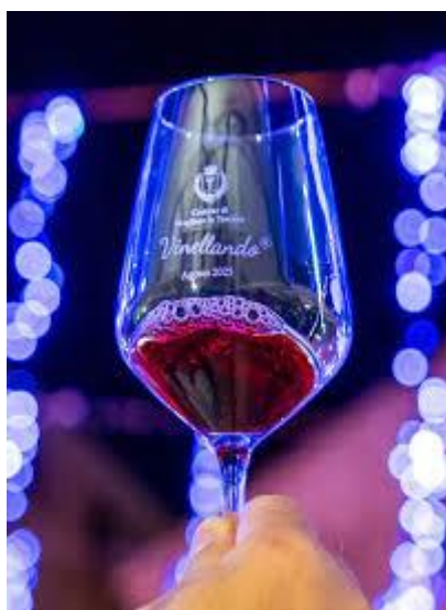
45 Vinellando 2025e