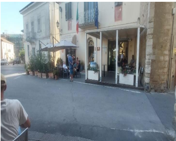
48 Outdoor veranda Bar and entrance