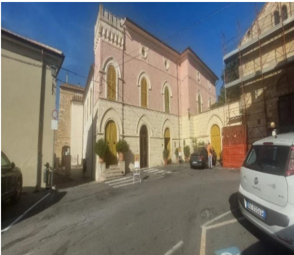
34 Palazzo Margherita