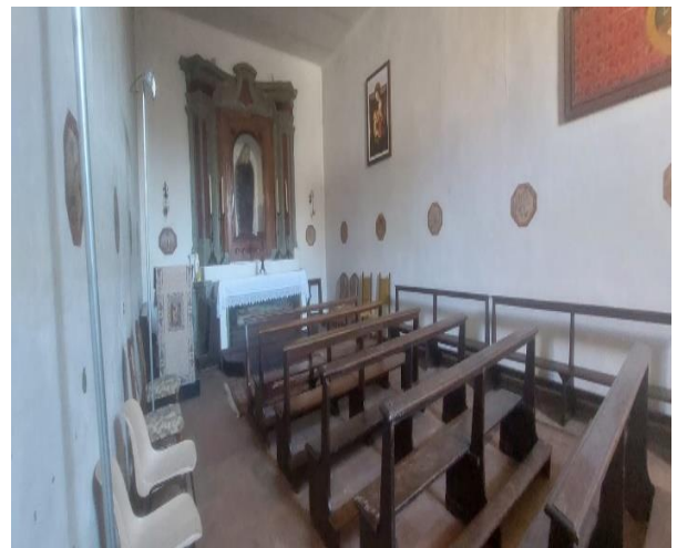
25 Interior Chapel

Project carried out with the contribution of the