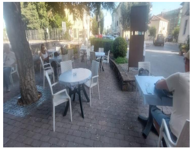
49 Tables and bar area on the top

Project carried out with the contribution of the