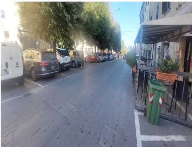
1 Public parking via XXIV Maggio