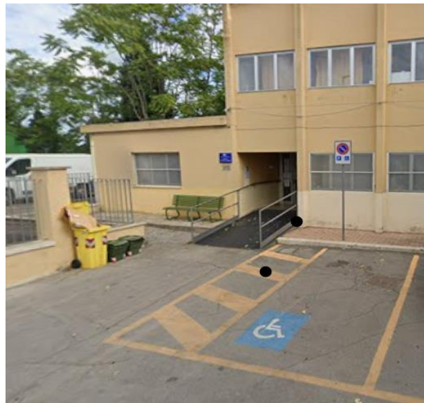
22 Entrance to the Town Hall with reserved stall

Project carried out with the contribution of the