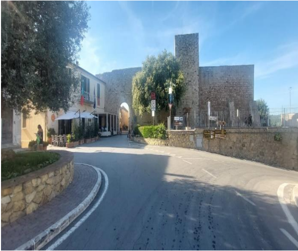
7 Route from the public car park to Porta San Giovanni (Porta Nuova)