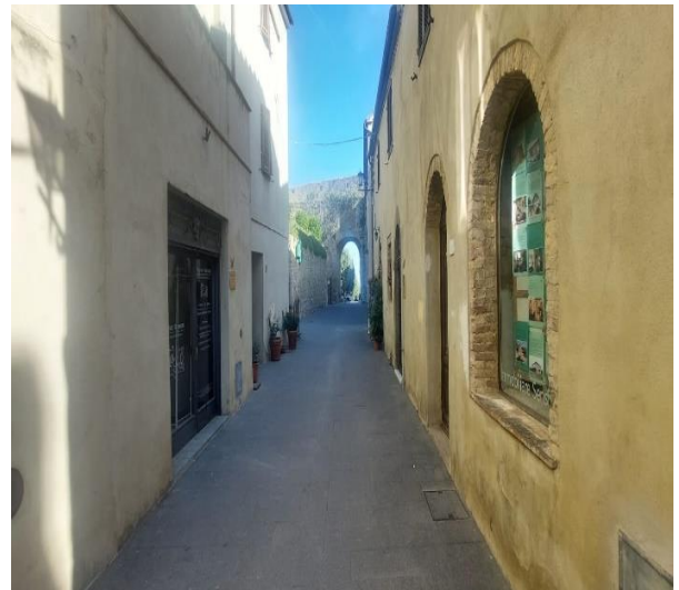
14 Via Garibaldi (village entrance)

Project carried out with the contribution of the