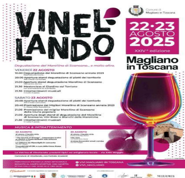
43 Vinellando poster

https://www.comune.magliano-in-toscana.gr.it/home/vivere/territorio/vinellando.html