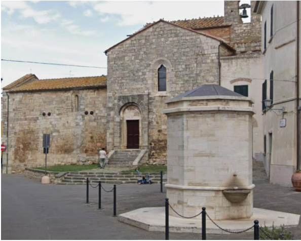
32 Side entrance of the Church of San Martino