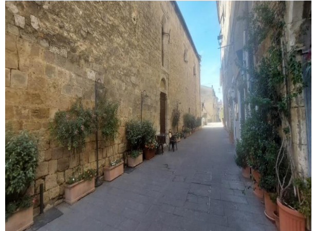
19 Via Garibaldi, left side of the Church of San Giovanni Battista