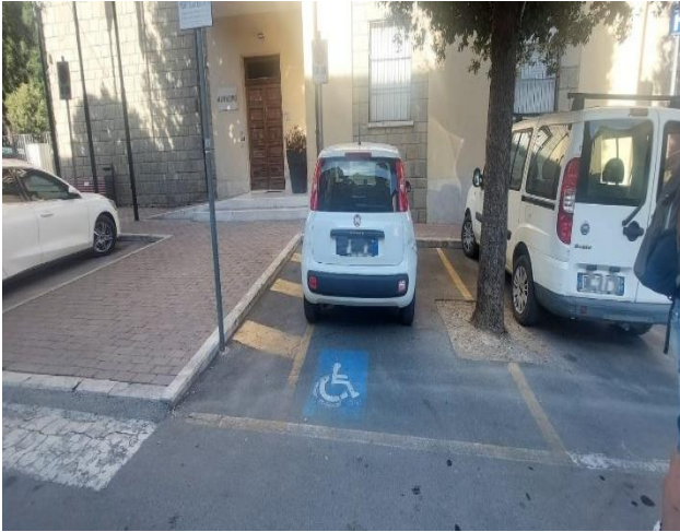
3 Reserved parking Via XXIV Maggio