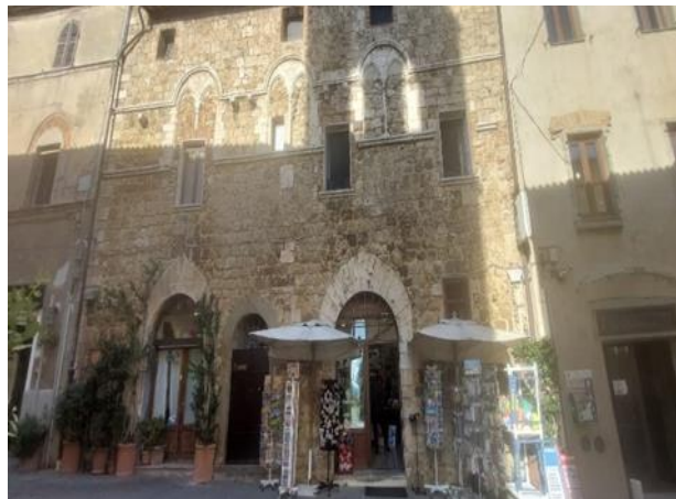
17 Checco Palace the Handsome

Project carried out with the contribution of the