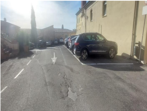
5 Public parking near Porta San Martino