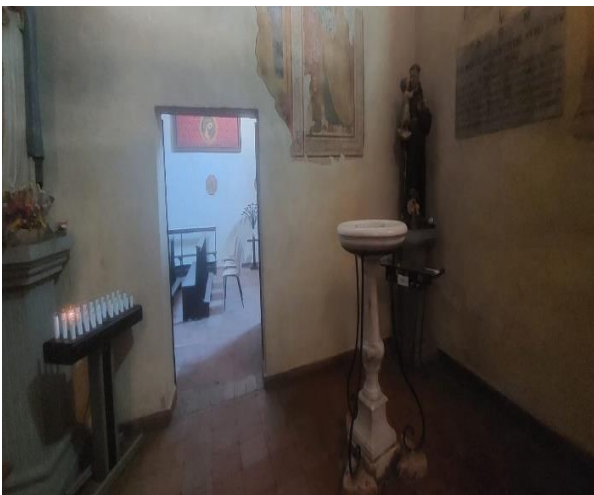
2413 Travertine baptismal font