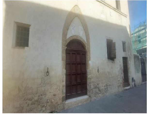
29 Step Entrance portal