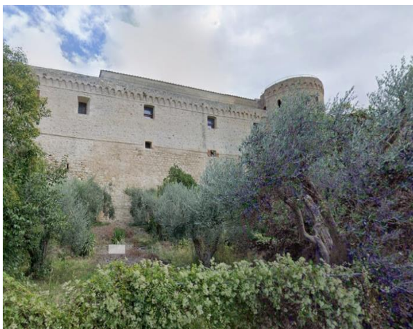
20 wall circuit