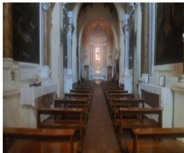
27 Interior Church with a single nave

Leaving the church of S. Giovanni Battista, continue left on Via Garibaldi until you will find the Palazzo dei Priori and Palazzo del Capitano after about 10 meters. The building was built by Pietro Salimbeni Benassai in 1425, while the numerous coats of arms on the façade belonged to the various captains who succeeded one another over the centuries. The main entrance door is surmounted by a pointed arch.