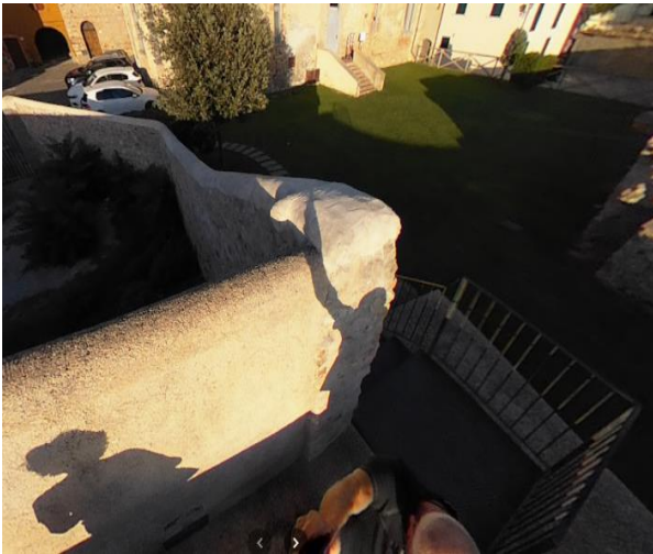
16 Via C. Battisti. Staircase to access the walkway of the city walls