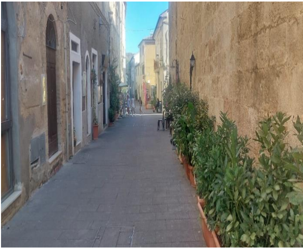
20 Regular paving in Via Garibaldi