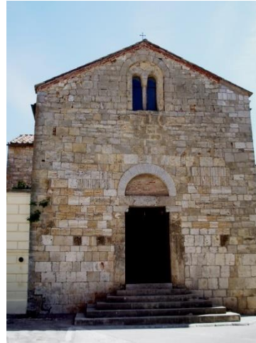
33 Front Entry