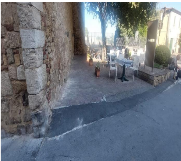
9 Ups and downs adjacent to the right side of Porta San Giovanni