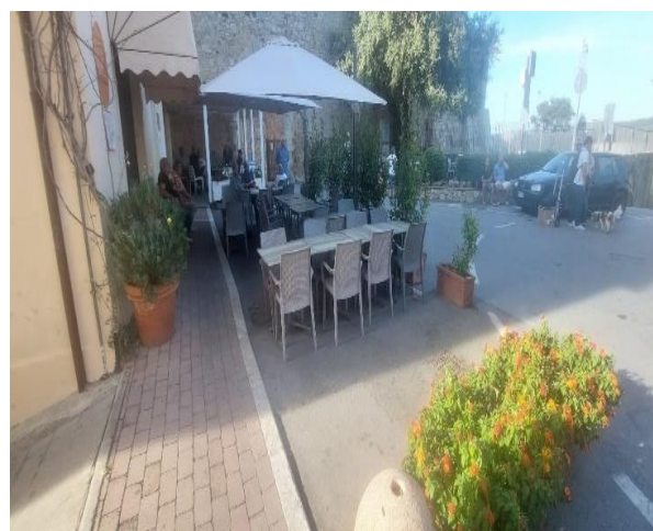
47 Outdoor veranda