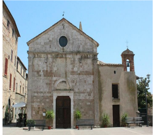
1223 External façade