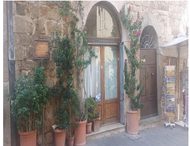
116 Palazzo Checco the beautiful