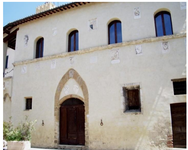
31 Coats of arms of the noble families affixed to the façade

Project carried out with the contribution of the