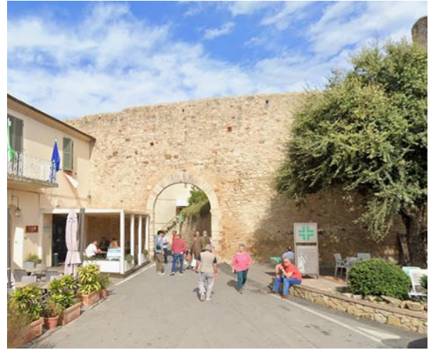
8 Porta San Giovanni (Porta Nuova)