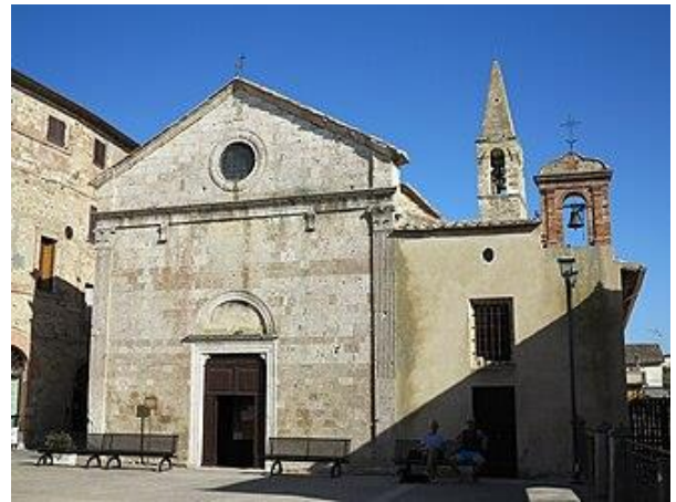
21 Façade of the church of San Giovanni Battista

Project carried out with the contribution of the