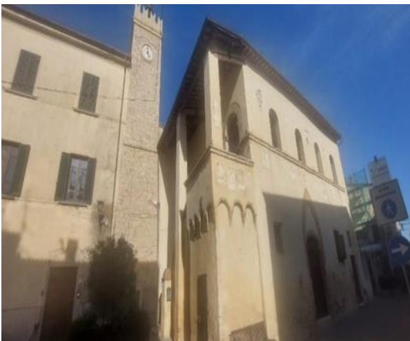
30 Palazzo dei Priori