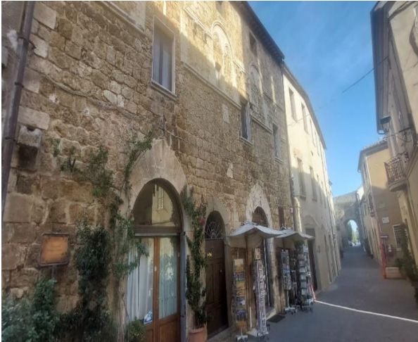
18 Checco Palace the Handsome