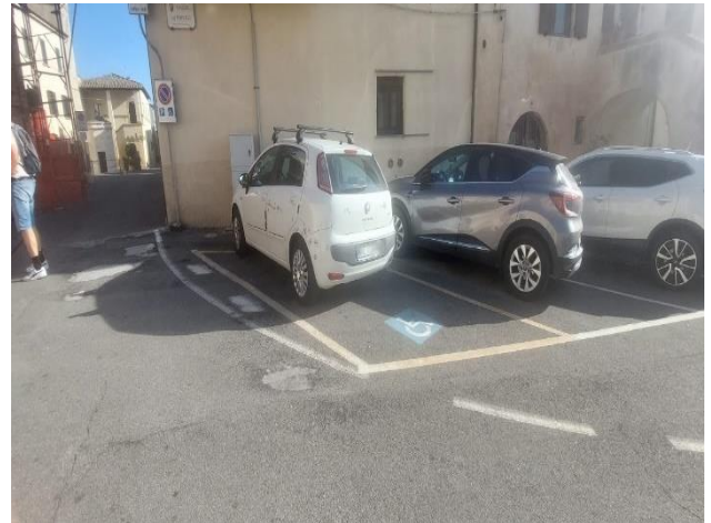
6 Reserved parking near Porta San Martino

Project carried out with the contribution of the