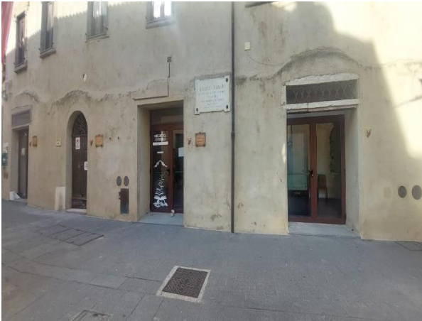
15 Via Garibaldi 8, Palace with epigraph to Garibaldi

Via Garibaldi is a smooth and obstacle-free stone-paved road with a maximum gradient of 1.5%. No totems or information systems accessible along the route were detected.