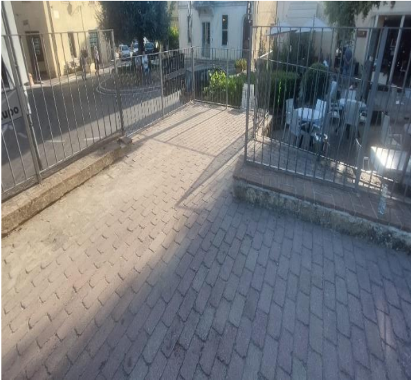
11 Entrance Panoramic terrace